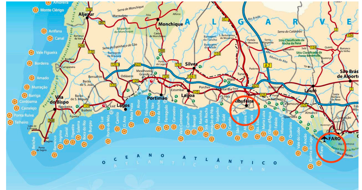
(Above) Faro Airport to Albufeira (45km) | Resort Lobby (Below)